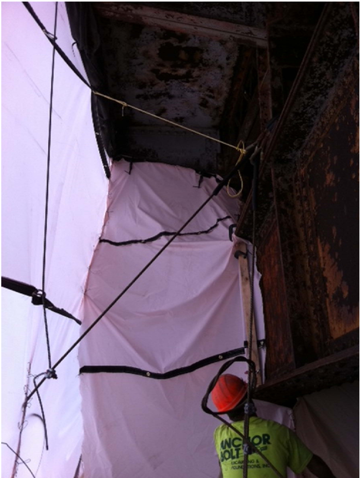
Containment Divider Tarpaulin