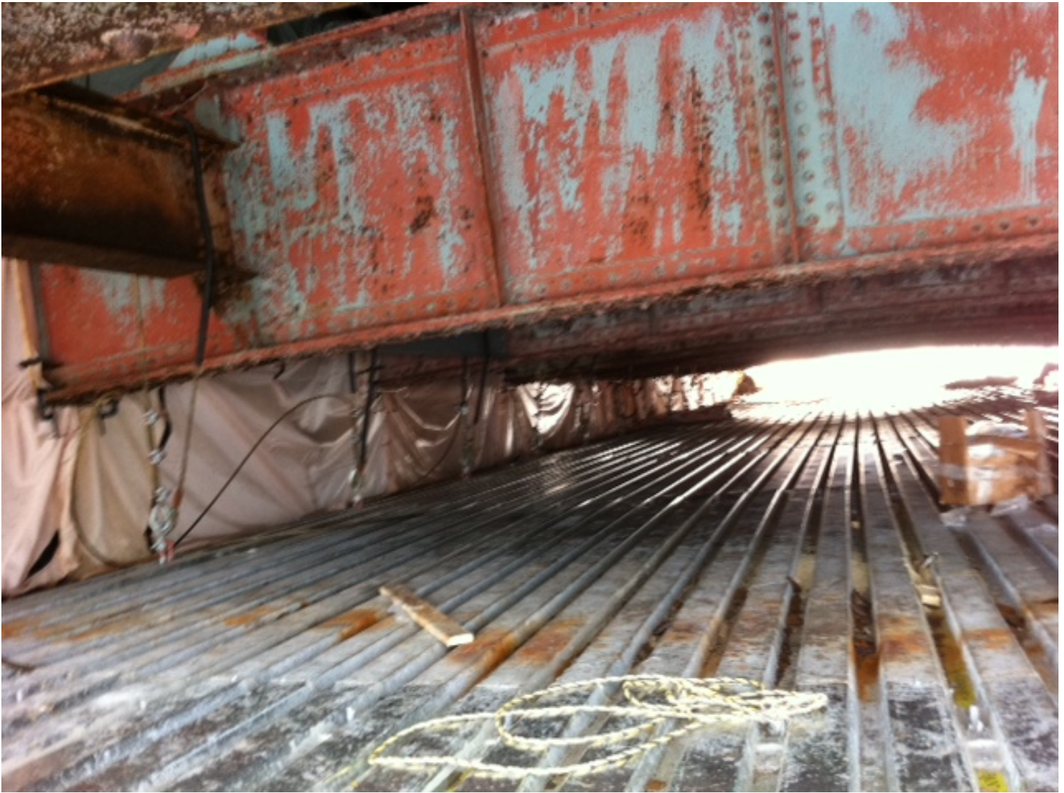
Lower Level Cable/Metal Deck Platform & Containment