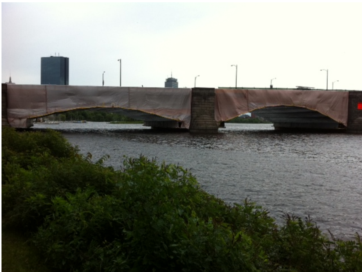
Lower Cable/Metal Deck Platform Conforming to the Arch & 10 ft. wide Tube & Hanger Platforms on Each Side of Piers