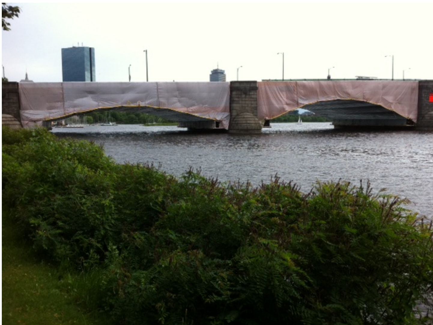
Lower Cable/Metal Deck Platform Conforming to the Arch & 10 ft. wide Tube & Hanger Platforms on Each Side of Piers