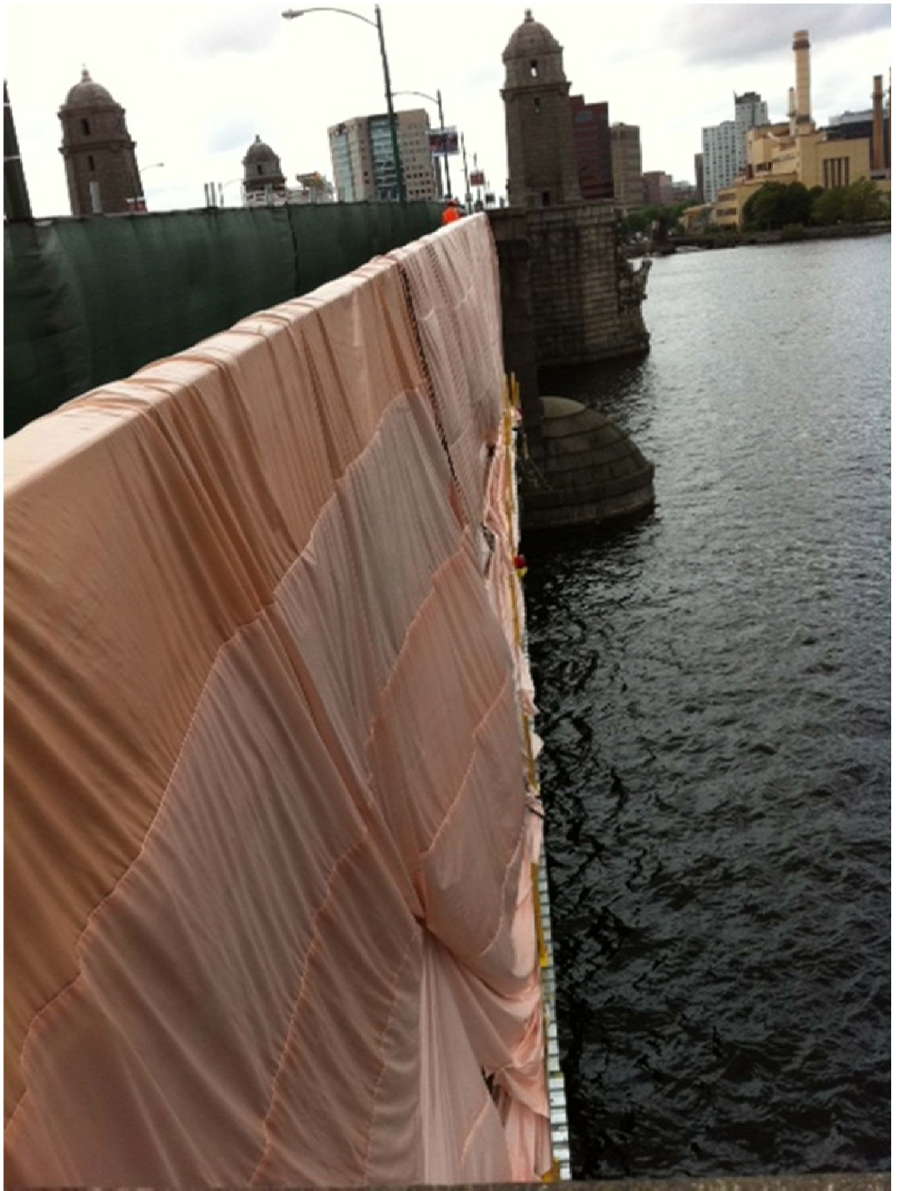
Side Containment Top of Structure to Cable/Metal Deck Platform